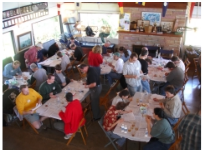
Judging View from Aloft