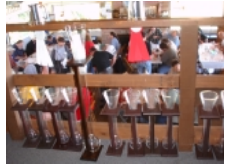
It Tastes Like...